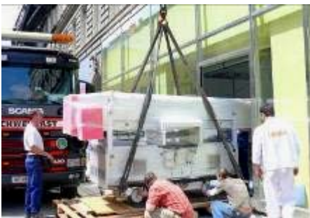
Delivery of new machine