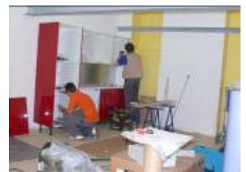
Future work kitchen"