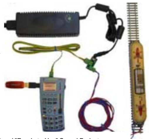
Load "Ready-to-Use" Sound Projects using MX31ZL and the USB-Stick.

2) . . . as "Full-Featured" - Project : This is a ZIP file which is downloaded, but not directly loaded into the decoder, but can be extracted ("unzipped") and processed by ZSP (the ZIMO Sound Program). Within ZSP assignments and settings can be modified in a comfortable way, Sound Samples taken from the external sources can be substituted for existing sound samples and new projects from existing sound samples can be created, etc.