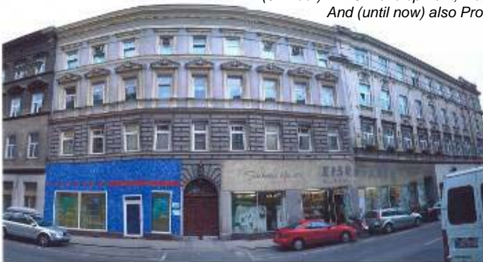
(Ground floor Model railway Club, until 2008: Hardware dealer Büsch 2008: ZIMO House (Schönbrunner Straße 188) and around