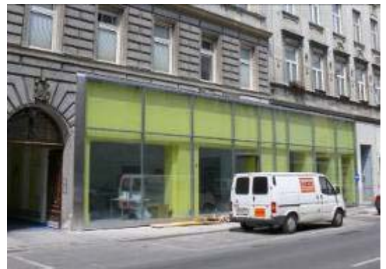
New ZIMO Production room in former Büsch premises Construction Mai 2009: Schönbrunner Straße 188 und 186