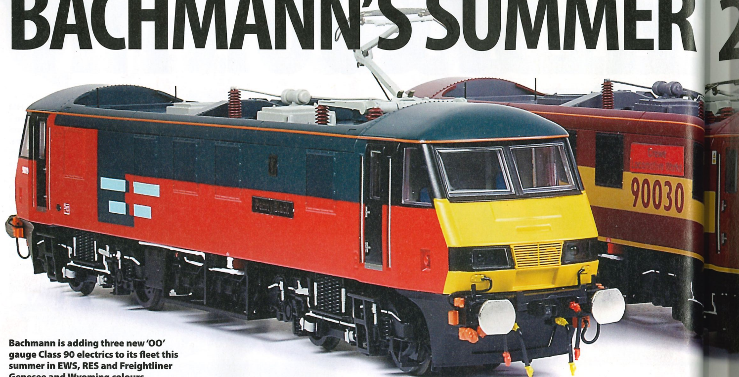
Bachmann is adding three new 'OO' gauge Class 90 electrics to its fleet this summer in EWS, RES and Freightliner Genesee and Wyoming colours.

B ACHMANN has unveiled the latest British Railway Announcements for its Summer 2022 release plans, with new colourful identities for its 'OO' Class 90s, more digital sound-fitted models in 'N' and 'OO' and a raft of new additions to the Scenecraft range.