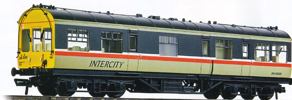
InterCity (Swallow) livery is set to appear on Bachmann's 'OO' gauge LMS 50ft Inspection Saloon for the first time.