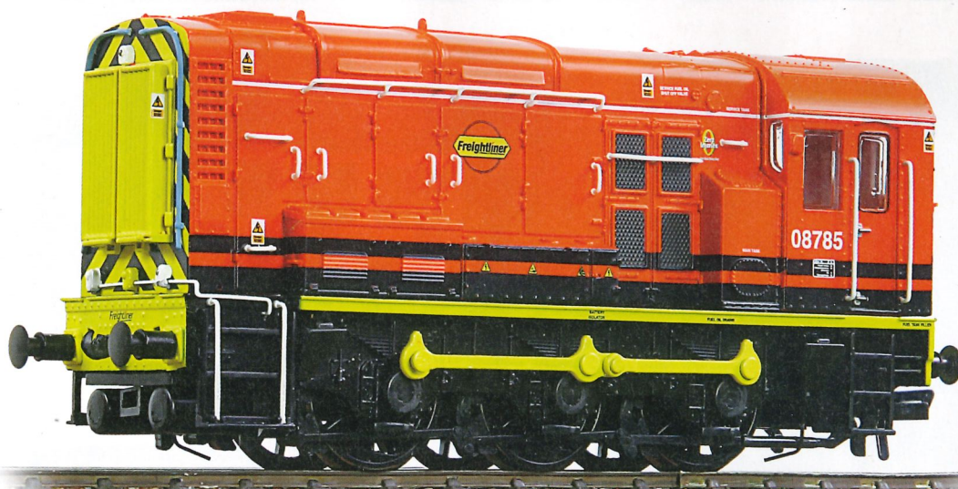
Freightliner's eye-catching orange, yellow and black is set to adorn 'OO' Class 08 shunter 08785.

nameplates will also be included where appropriate, and they will be available in DCC ready or DCC sound-fitted (ESU Loksound V5) formats.