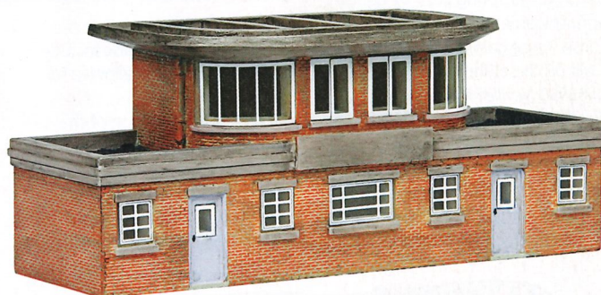
Southern 'N' gauge modellers will benefit from this art-deco signal box in Bachmann's Scenecraft range.

Finally, Bachmann is also adding functional BSI NEM couplings to the company's accessory range (36-074). Developed during the retooling of its 'OO' gauge Class