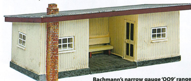
Bachmann's narrow gauge 'OO9' range continues to expand with this Scenecraft corrugated station, available in brown/cream and green/cream.