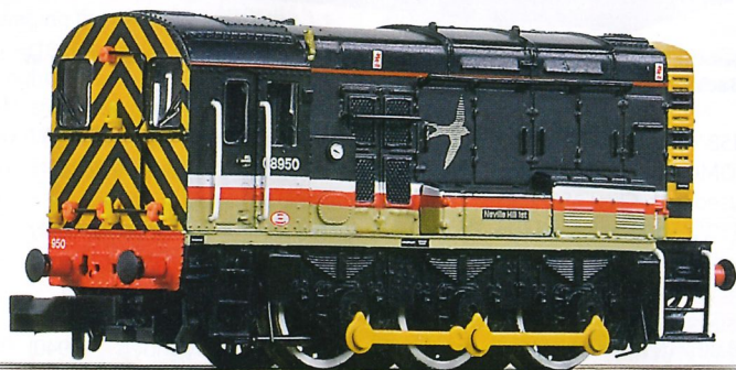
Bachmann has added another of its upgraded 'N' gauge Graham Farish Class 08 diesel shunters to the range as 08950 Neville Hill 1st in InterCity (Swallow) livery.

Following close on the heels of Bachmann's Spring 2022 'N' gauge announcements, the Graham Farish range gains an additional BR Class 08 diesel shunter in the form of 08950 Neville Hill 1st in InterCity 'Swallow' colours (371-005A/SF). The model is set to appear in DCC ready and DCC sound-fitted forms and will also benefit from the recent chassis upgrade with Next18 DCC decoder socket and factory-fitted speaker.