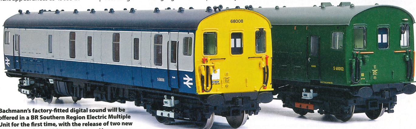
Bachmann's factory-fitted digital sound will be offered in a BR Southern Region Electric Multiple Unit for the first time, with the release of two new 'OO' gauge Class 419 Motor Luggage Vans.

Bachmann's 'OO' gauge EFE Rail range is bolstered this quarter with a new example of its recently-introduced four-car 1938 London Underground tube stock as set 136 in Bakerloo Line red livery with white bodyside roundels (E99940), representing an example selected »