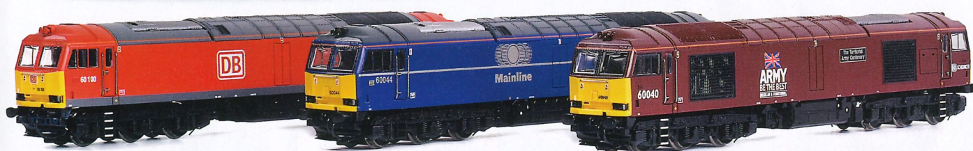
Bachmann's Graham Farish range benefits from three new sound-fitted 'N' gauge Class 60 diesels in Mainline Freight, DB Cargo and DB Schenker/Army colour schemes.