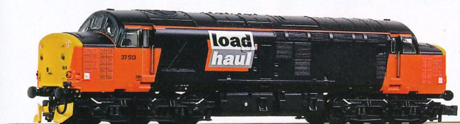
Loadhaul's distinctive orange and black livery is set to appear on Bachmann's Graham Farish 'N' gauge Class 37 37513.