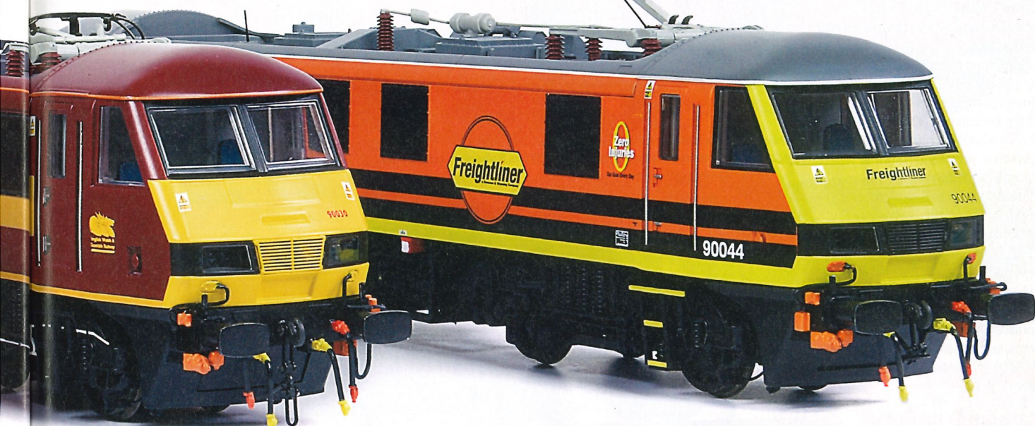
TABLE 2 - GRAHAM FARISH 'N' LOCOMOTIVES SUMMER 2022