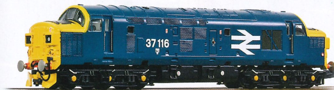
Bachmann is also adding a series of sales area exclusive 'N' gauge Class 37s to its Graham Farish range, including 37116 in BR blue with large logos and yellow bonnets.

to the previously announced DCC ready examples, finished as 60044 Ailsa Craig in Mainline blue (371-351A/SF), 60100 Midland Railway - Butterley in DB Cargo red (371-359/SF) and – making its debut – 60040 The Territorial Army Centenary in DB Schenker/Army red (371-361/SF).